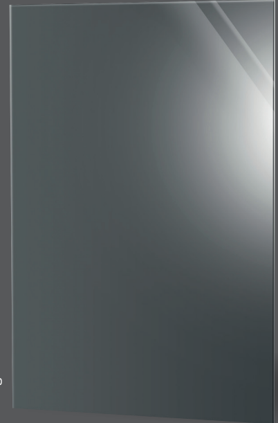
Image: mirror model

MIRROR GLASS 600W 60×90cm 11.85kg/13.9kg*